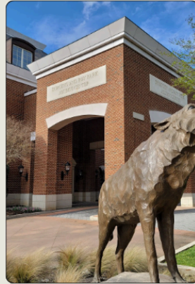
9/5 DOROTHY & ROY PARK ALUMNI CENTER