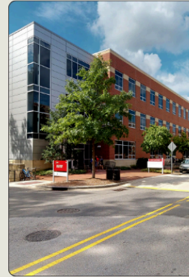
11/7 HOLMES HALL ROOM 110