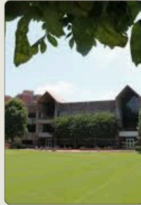
10/3 WITHERSPOON ROOM 356